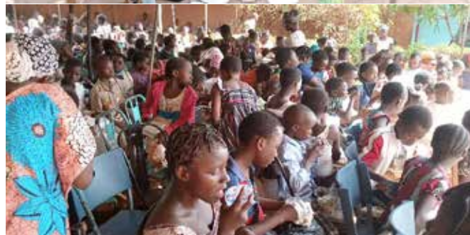
Christmas of children in difficulty with other children in the bishopric of Koudougou