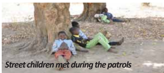
Street children met during the patrols

SERIOUS CRIMES (SALE OF DRUGS, THEFT WITH A STABBING WEAPON, AIDING AND ABETTING, PROSTITUTION) STRONG DRUG ADDICTION STRONG IDENTITY BELONGING TO THE STREET PROLONGED BREAKDOWNS OF FAMILY TIES NUMEROUS PASSAGES IN INSTITUTIONS, INCLUDING THE PRISON ENVIRONMENT.