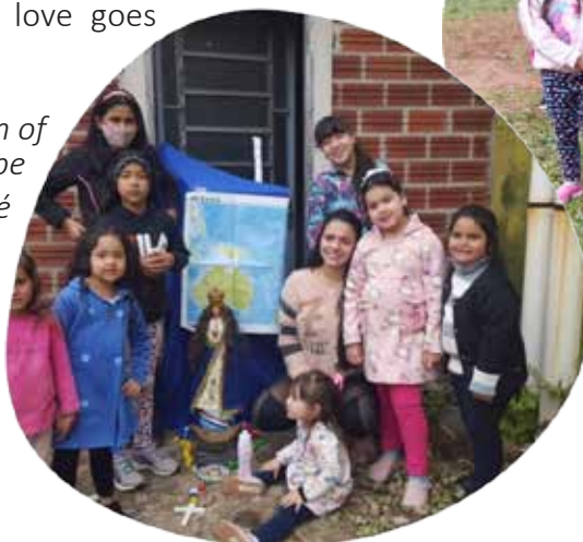
Chapel of the Virgin of Caacupe Choré

This is how the children and adolescents of this community, inspired by what they saw on social networks, met every day in their chapel, accompanied by their parents, to recite the Rosary of Dawn. We start by praying together, then sharing breakfast and some songs, full of joy and enthusiasm for the missions, because a small gesture full of love goes beyond borders.