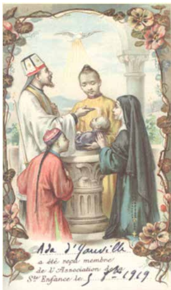
Holy Childhood prayer card - year 1919

Given in Rome at Saint Peter's, on 30 November 1919, the sixth year of Our Pontificate