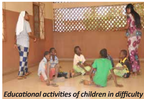
Educational activities of children in difficulty

Our experience in the field of street children has allowed us to identify the reasons of their situation. These are family conflicts, the child's position within his family, as well as family economic difficulties which are also factors that weaken the family balance, resulting in the child being exposed to the following situations: non-attendance at school, idleness, exodus from the countryside, street situation, begging. The poverty and misery of the parents also justify the presence of children on the street and put them in situations of vulnerability. The other causes are, for example: single-parent families (children of single mothers), the lack of education, the persistence of some Koranic teachers in letting children beg, orphans left to fend for themselves. In addition, the children of parents who emigrated to Ivory Coast who are entrusted to their grandparents, the lack of love of parents and society towards children. These are the main reasons for the presence of so many vulnerable and abandoned children in the Diocese.